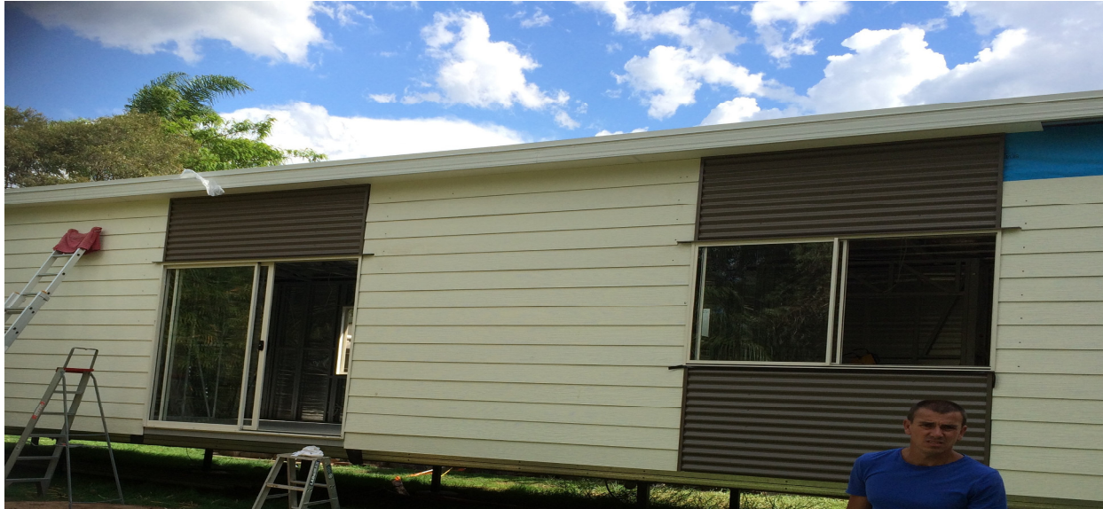
Cladding pictured will incur additional charges.