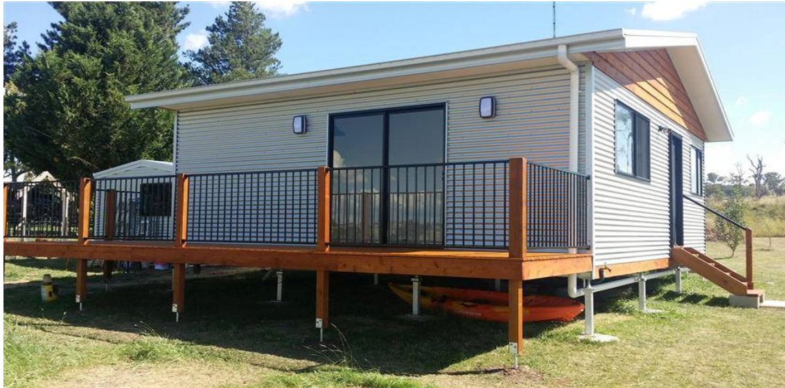
Red Cedar Cladding & deck supplied by client. Not included in pricing